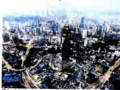
Malaysia's strong economic performance is due to the continued expansion in domestic demand, as well as the strengthening of exports through strategic policies implemented by Datuk Seri Najib Razak when he became prime minister in 2009.

It is also a fact that the economy then was suffering, absorbing the full impact of the 2008 global financial crisis. Exports fell to their lowest level since 2001,